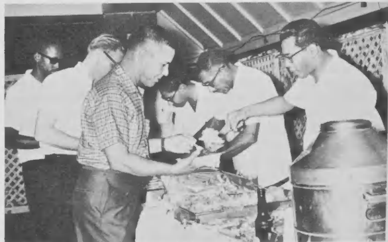
Mechanical Engineering personnel enjoy themselves at a barbecue-style Christmas party held at the Aruba Golf Club last month. They donated Fls. 130 to the Aruba Charity Assn.